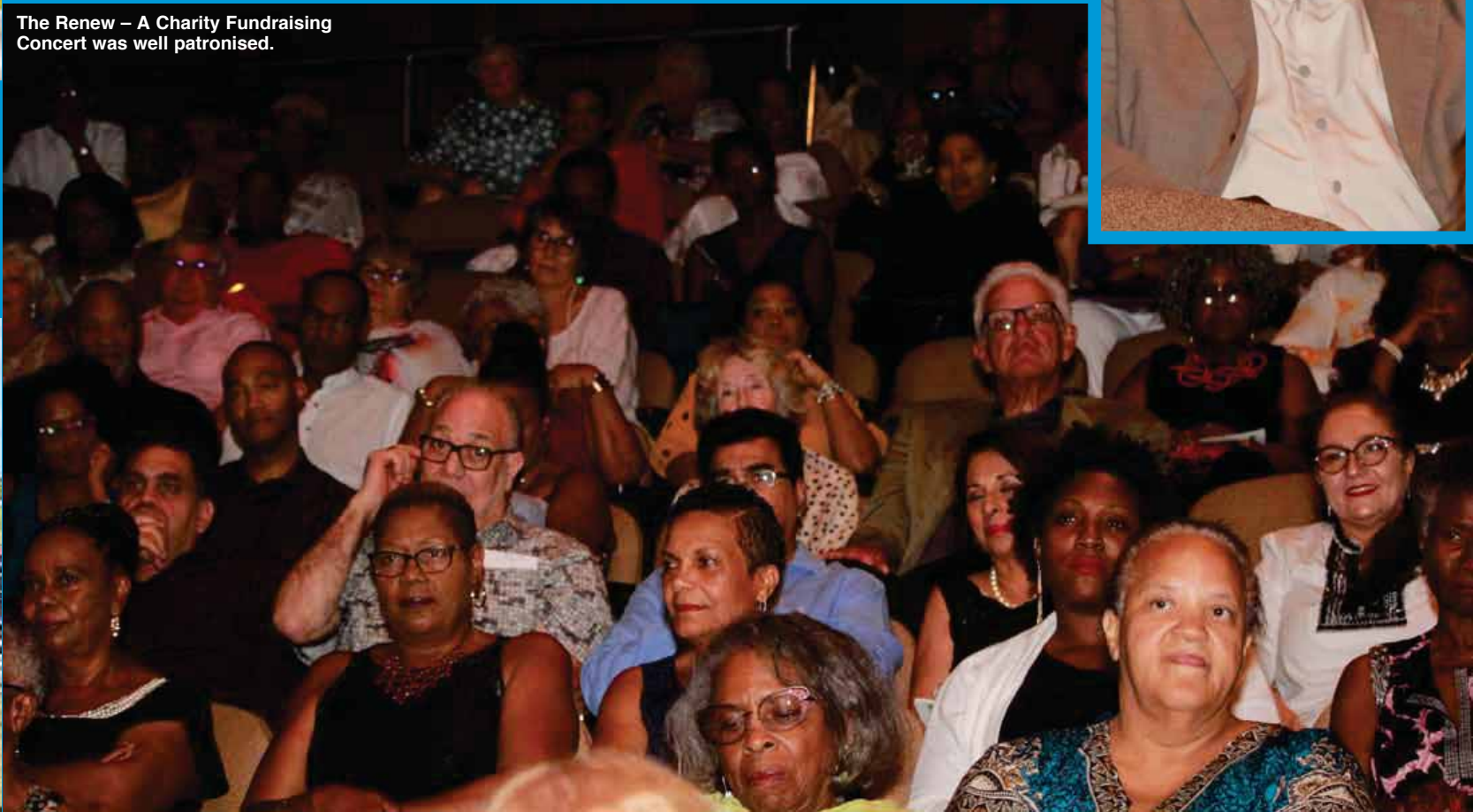
The Renew – A Charity Fundraising Concert was well patronised.